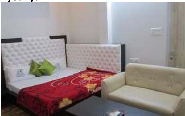
Ramprastha hotel, ayodhya