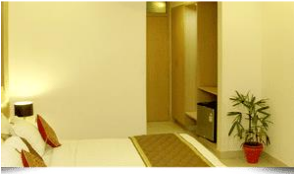
Hotel crown palace Allahabad