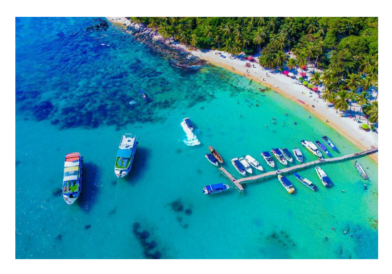
Day 7 Phu Quoc