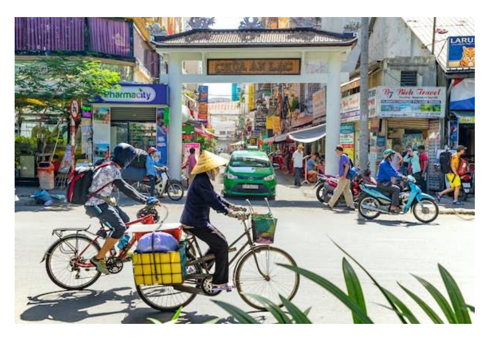
Day 6 Phu Quoc