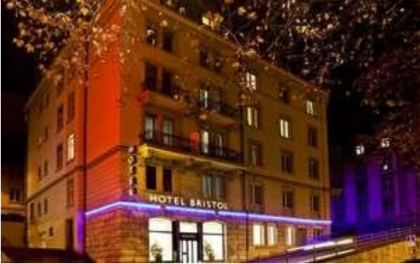
Hotel Bristol Zurich Stampfenbachstrasse 34 Zurich - 8035 , Switzerland