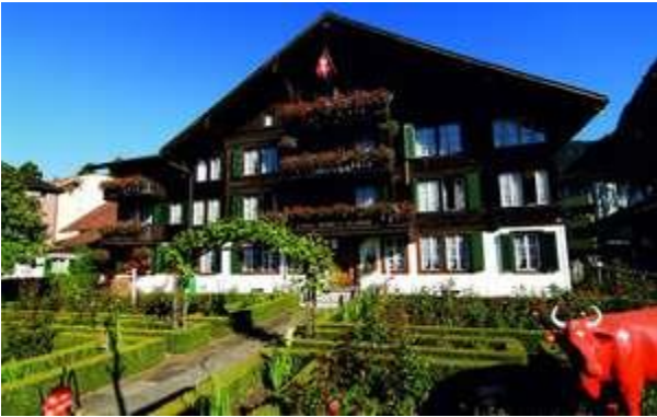
Hotel Chalet Swiss Seestrasse 22, Unterseen, Interlaken 3800, Switzerland