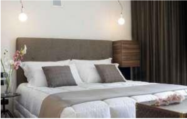
Hotel Unicornio Via dei Fossi 27, Santa Maria Novella, 50123 Florence, Italy