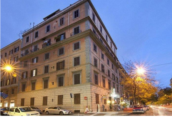
Montreal Hotel Via Carlo Alberto 4, 00185 Rome, Italy