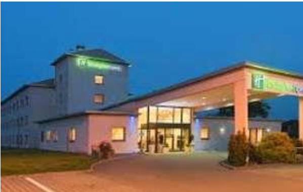
Holiday Inn Express Luzern - Neuenkirch Raststaette Luzern Neuenkirch A2 Neuenkirch - 6023 , Switzerland