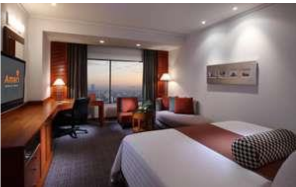
Amari Watergate Bangkok 847 Petchburi Road Pratunam/Pathumwan Bangkok - 10400,