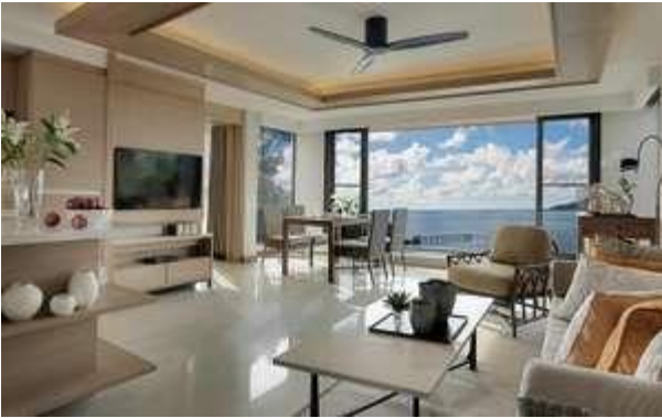
Amari Phuket 2 Meun-Ngern Road, Kathu, Phuket, 83150 Patong Beach, Thailand