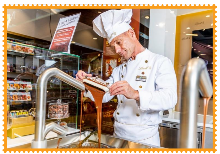
Swiss Chocolate Adventure

Visit Mt. Titlis- enjoy Cable car rides including the world's first rotating cable car, the Rotair – to the top of Mt. Titlis at 3,020 metres. Orientation tour of Lucerne. Experience a Swiss Chocolate