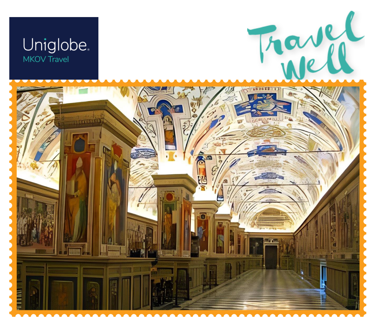
Vatican Museum with Sistine Chapel