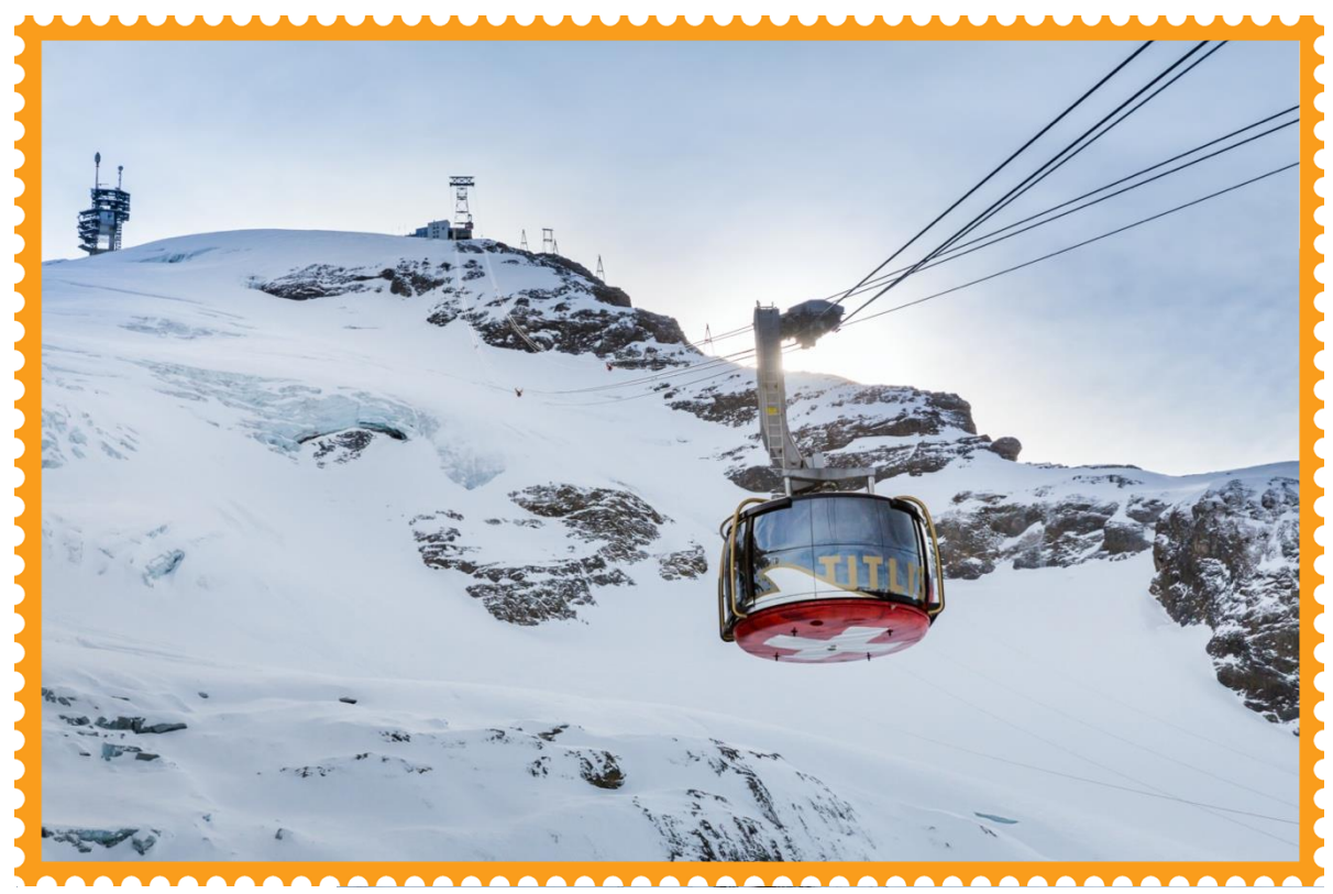
ROTAIR to Mt. Titlis

panoramic view that stretches across the Aletsch Glacier, the longest glacier in the Alps. This is a journey into a world of unparalleled natural splendour that you will remember for a lifetime. Overnight in Central Switzerland. (Breakfast, Lunch, Dinner).