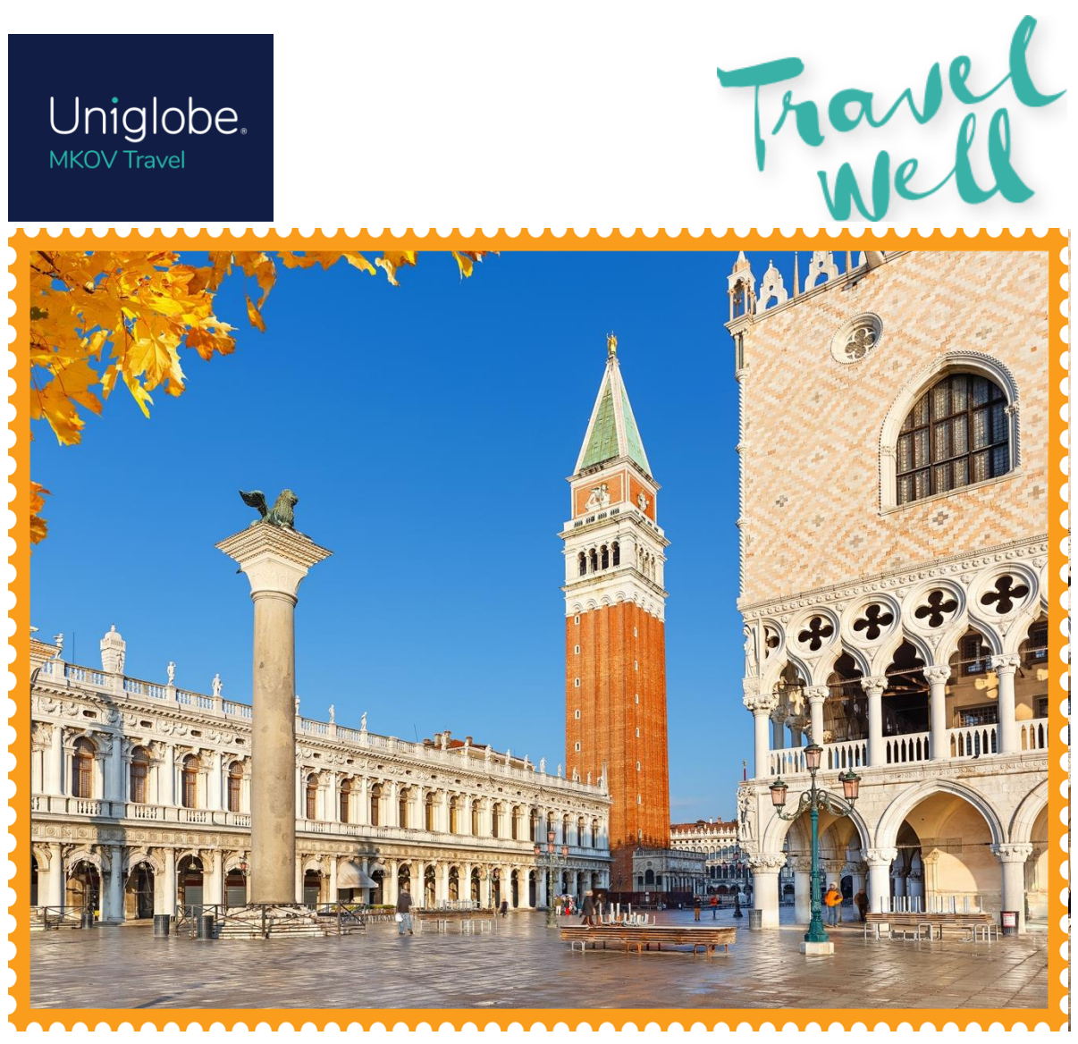
St. Mark's Square