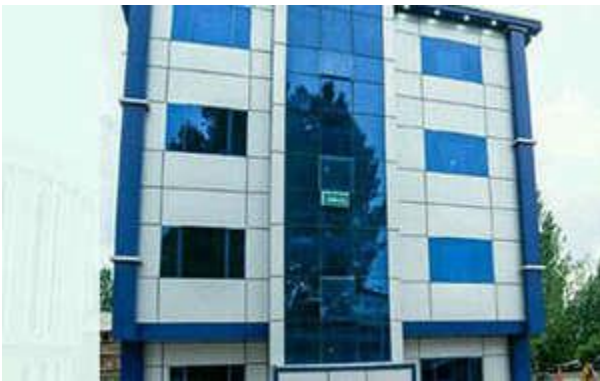
Hotel Grand Ibni Gani