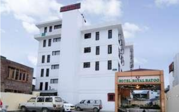
Hotel royal batoo