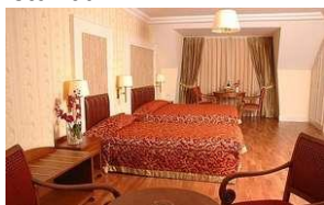
Taksim metropark hotel