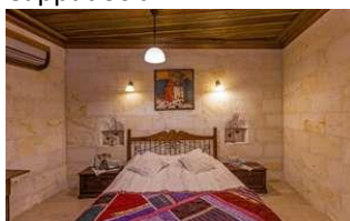
Mithra cave hotel